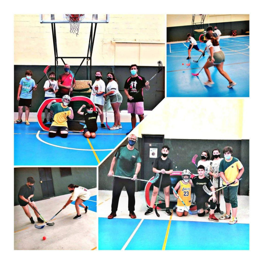
A collage of photos from the May and June promotional meetings.

The best thing is that the meetings continued weekly during May and June, with a small group of 7 or 8 regular participants, already in the sports pavilion, thanks to the kindness of the school sports association that gave us the court, with the aim of encouraging the practice of this sport in the center and start with the beginning of the course, a new nursery school in its facilities, and formed a group of parents of students interested in continuing practicing floorball in school the next course.