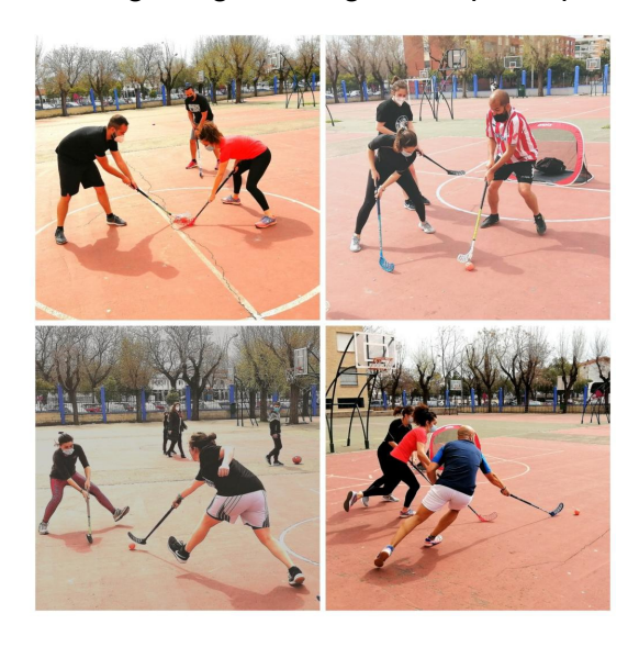
A collage of images during the initiation workshop of the recreational group.

With respect to recreational floorball, for adults, the season has been particularly difficult. With no activity at UCO, at least two meetings were held in the spring. On the one hand that of Sandra and Carolina, sportswomen and sports and health professionals, and a group of their friends, which brought together eight new participants.