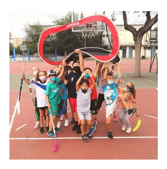
Weekend workshop at Maristas for 2nd grade group.