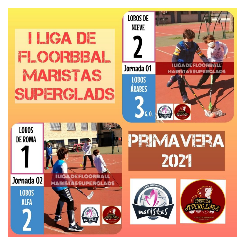
Promotional poster of the league with the results of the 1st and 2nd days.

After the Christmas vacations we started within the school a very interesting experience, our first and own floorball competition due to the impossibility of participating in any, since it currently only exists in the community of Madrid, very far away, and even with a ban on travel between communities. We launched the I Maristas Superglads League for children of #floorball #unihockey, in acronym #LMS. A 3×3 Street competition (without goalkeeper and with mini goals of 90×60 cm.), by the original and practical system, genuine of floorball, called "point master".