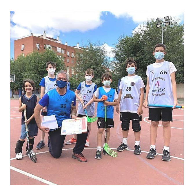
Last session of the Maristas Superglads nursery school.

And it is that the difficulties at the beginning posed a huge challenge that with enthusiasm and work of our athletes, kids and adults, mothers and fathers, and with the help of responsible institutions, schools, fantastic physical education teachers and sports clubs, collaborators and good friends, has resulted in the end a fantastic and unforgettable annual session. There is still a lot of work to be done, but much more fun, health and learning, for next season in which we hope to have more participants, do you join field hockey for all?