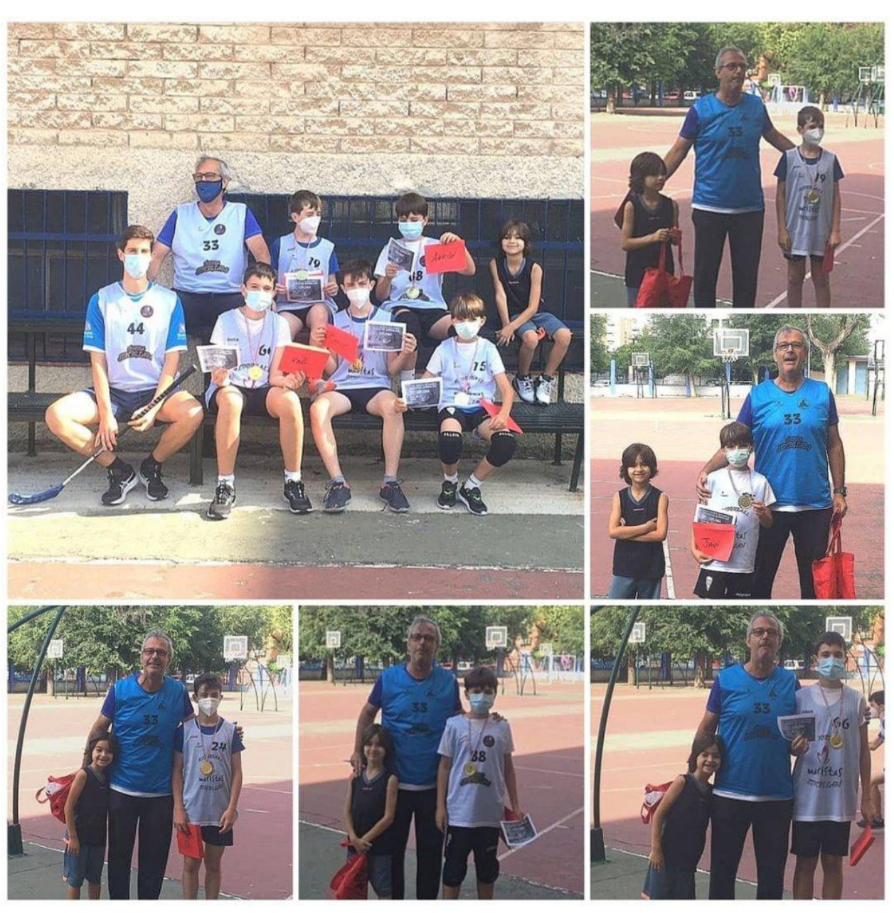
Churros with chocolate, diplomas and medals, and gifts for the teacher, great last day of school.

A total of 20 matches were played, which allowed two rounds of a league, and in each match combinations of players different from the previous ones, with each player individually accumulating points according to the result obtained by his team. An opportunity for our students to experience the sensation of victory and defeat, with no greater significance than playing for the sake of playing. Until the penultimate session the league did not end, and in the last one we had a small awards ceremony, a medal and a diploma recognizing each one, as a good Superglad, a superpower shown during the competition: super score, aiming, shooting, fighting or positivity. Skills that have made them grow sportingly and personally.