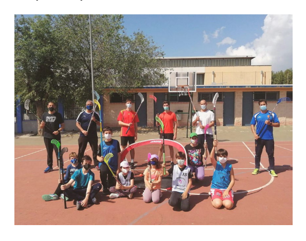
One of the meetings with friends, teachers and parents of the students.

On the other hand, two more meetings on Sunday after the nursery school, the group of aficionados friends of the club, physical education teachers, university students, parents of students of the schools, friends, more than a dozen in total, playing great full court games, in which also participated the students of the nursery school.