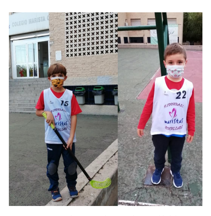
Our two initial 20-21 students, with reversible bibs.

We started the classes with only two students, in fact only one of them was able to attend the first session. The important thing was, as in the movie "to start again". A great and unforgettable session for all its significance of success and resistance to fatality, and that says a lot about the family and educational philosophy of our club. As long as we have a student, we have sport. With masks, gel, disinfection of material, outdoors, at night, and whatever it takes, but being where we wanted, on the court, and saying our favorite expression: Let's play!